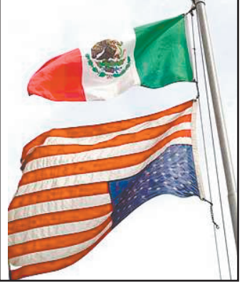
Montebello High (Calif.) Flagpole desecrated by the mobs

and faithfully seeking to become American citizens?