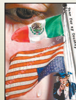
Montebello High (Calif.) Flagpole desecrated by the mobs